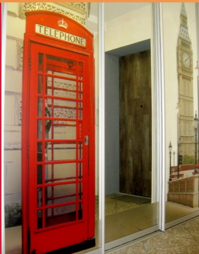
English classics. Clearness of lines and shapes. The order of SUN Studio Novokuznetsk.