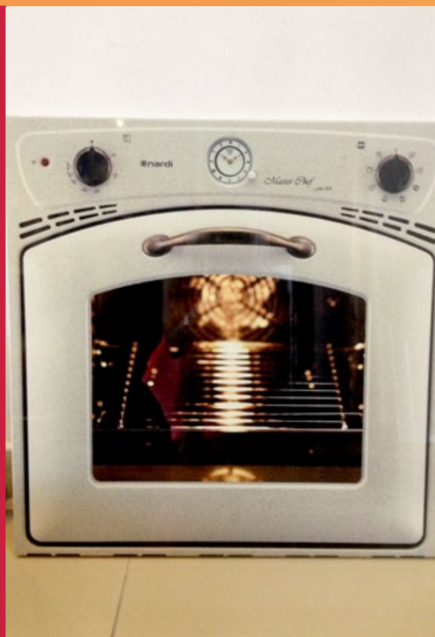
Taming the fire. Imitation of an oven on acrylic. Printed by SUN Studio Rudny.