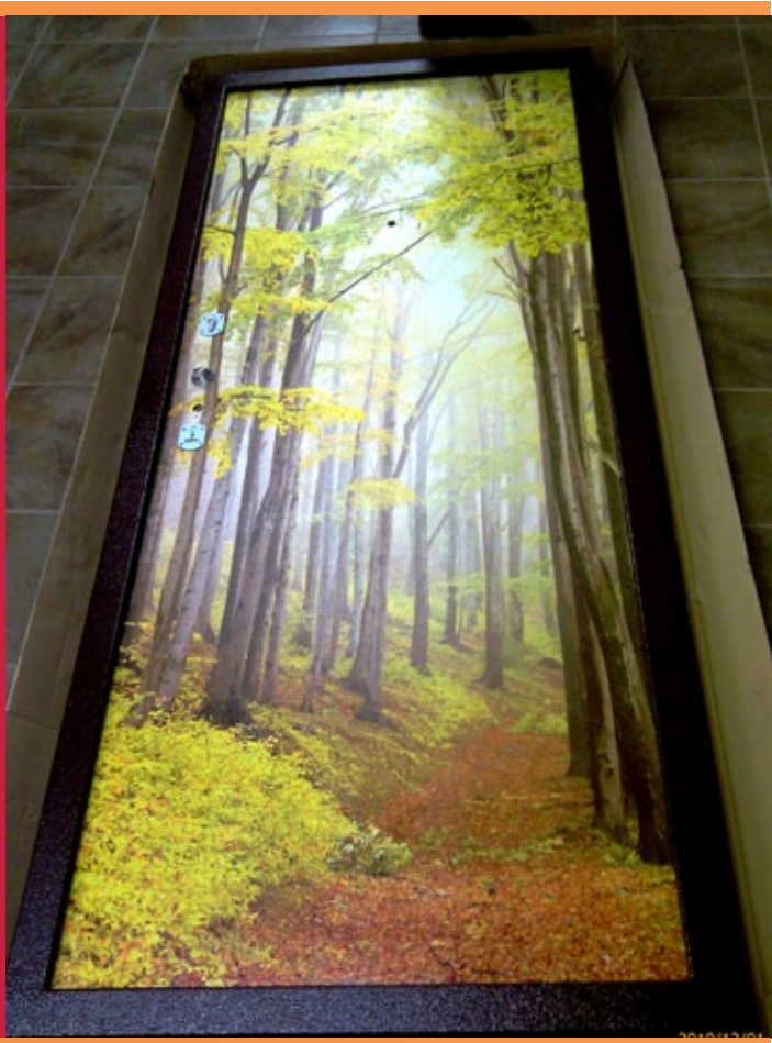
Autumn forest. The image on the metal door. The order of SUN Studio Astrahan.