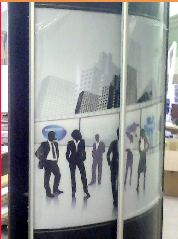
Business people. Stylish print on acrylic.