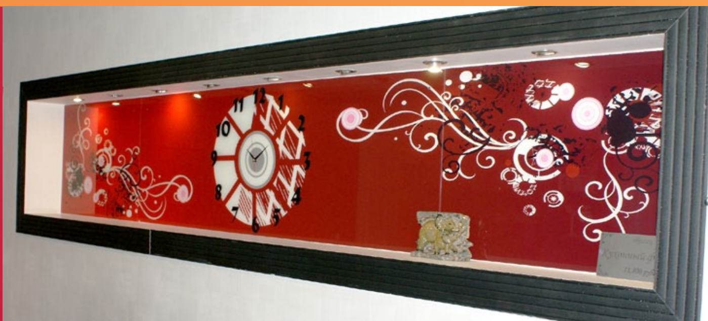
Mysteries of time. Glass kitchen panel with three-dimensional image clock dial. Made by SUN Studio Chita.