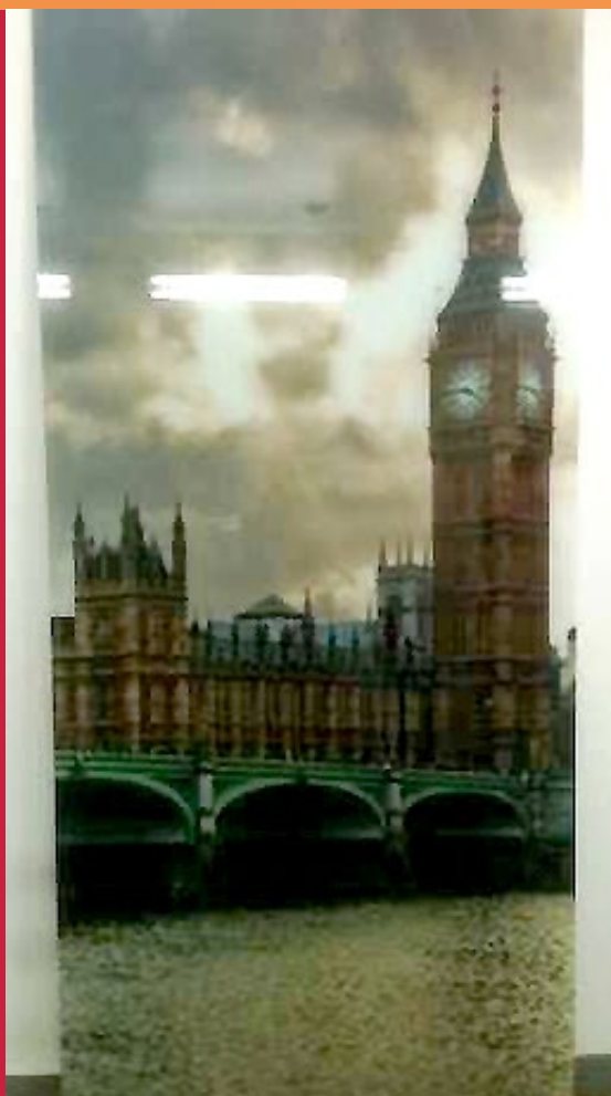
Big Ben. The legendary Tower of London in a gloomy landscape. Work by SUN Studio Kemerovo.