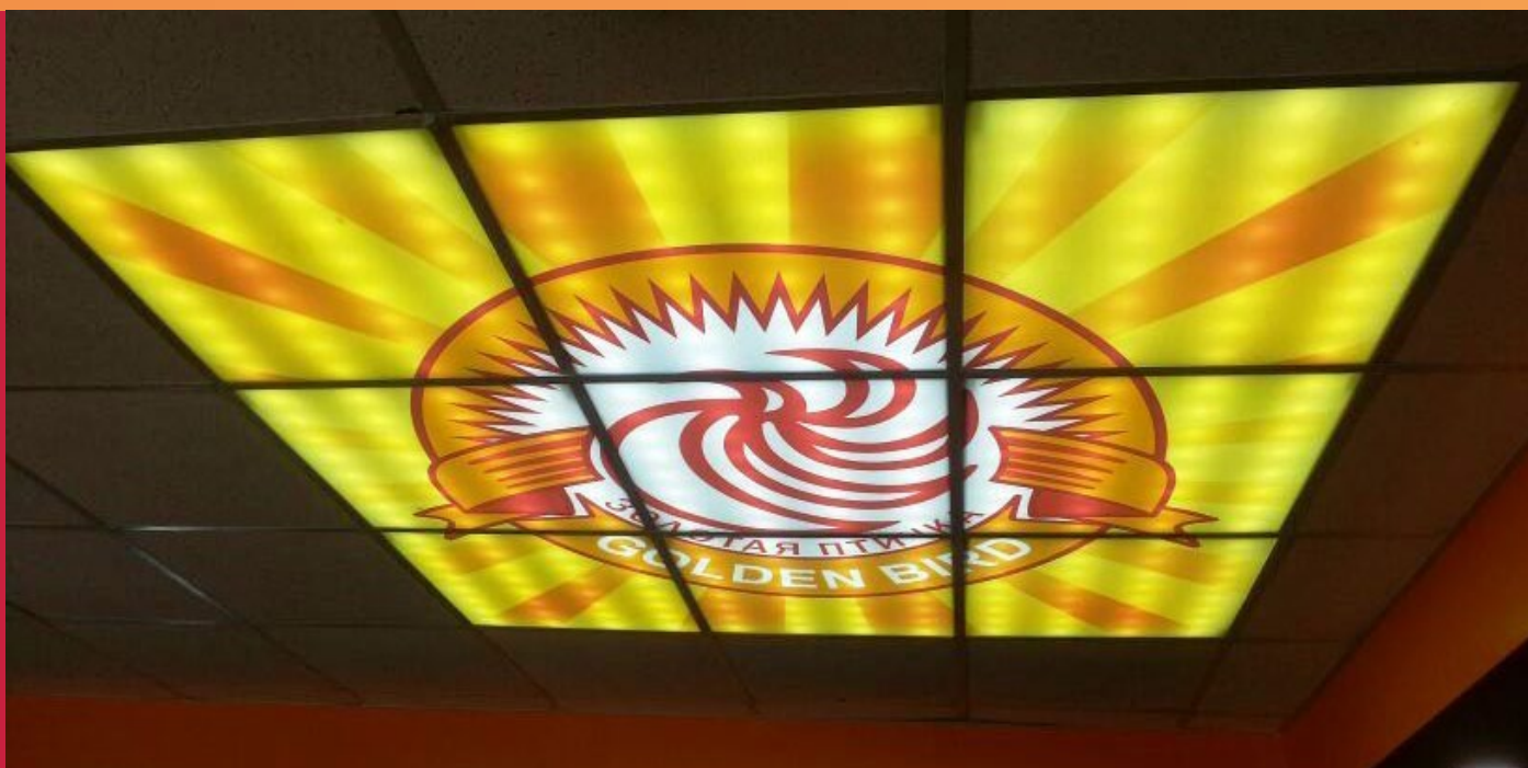
High note. Printing on acrylic made by SUN Studio Khabarovsk.