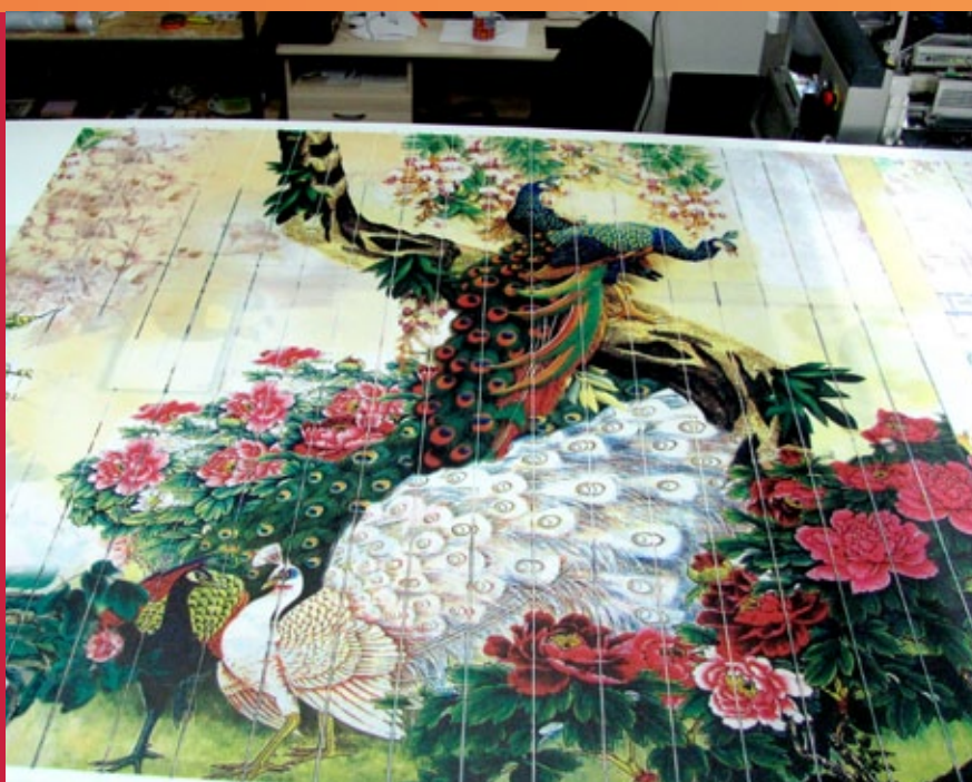
Birds of the emperor. World's most beautiful birds on the blinds. The order of SUN Studio Nalchik.