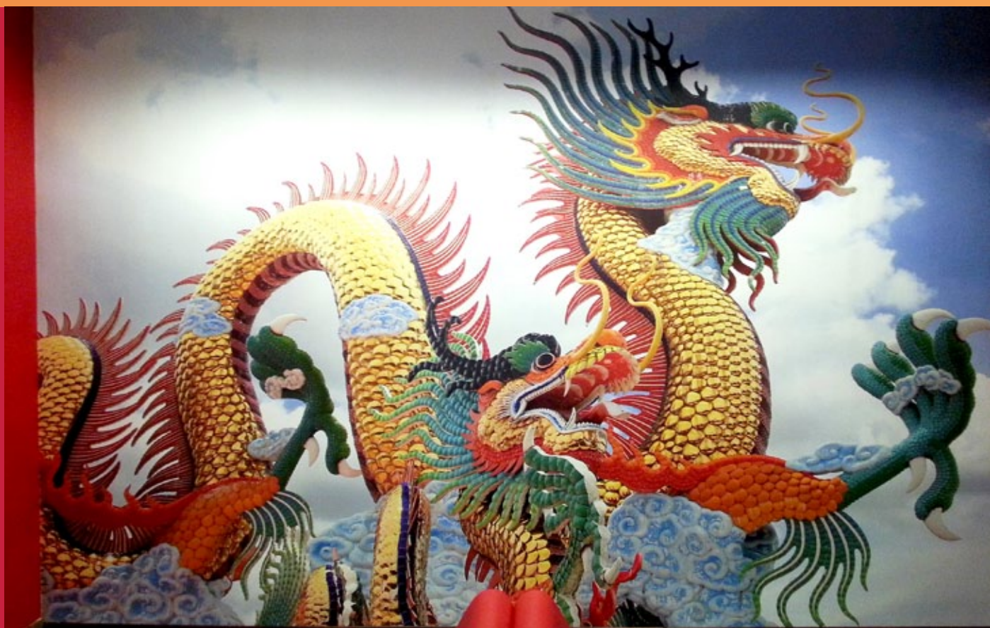
The winged serpent.

Mythical creature of extraordinary beauty on the wallpaper. Work by SUN Studio Khabarovsk.