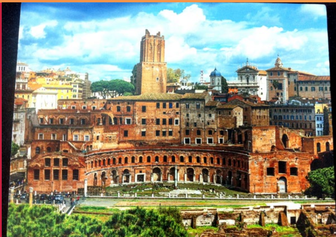
The ancient city.

Painting on canvas made by SUN Studio Moscow (Printing solution)