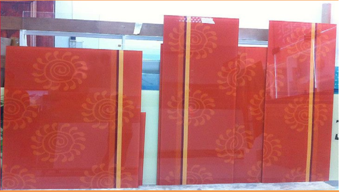
Hot sun. Bright stylish print on the glass made by SUN Studio Dubai.