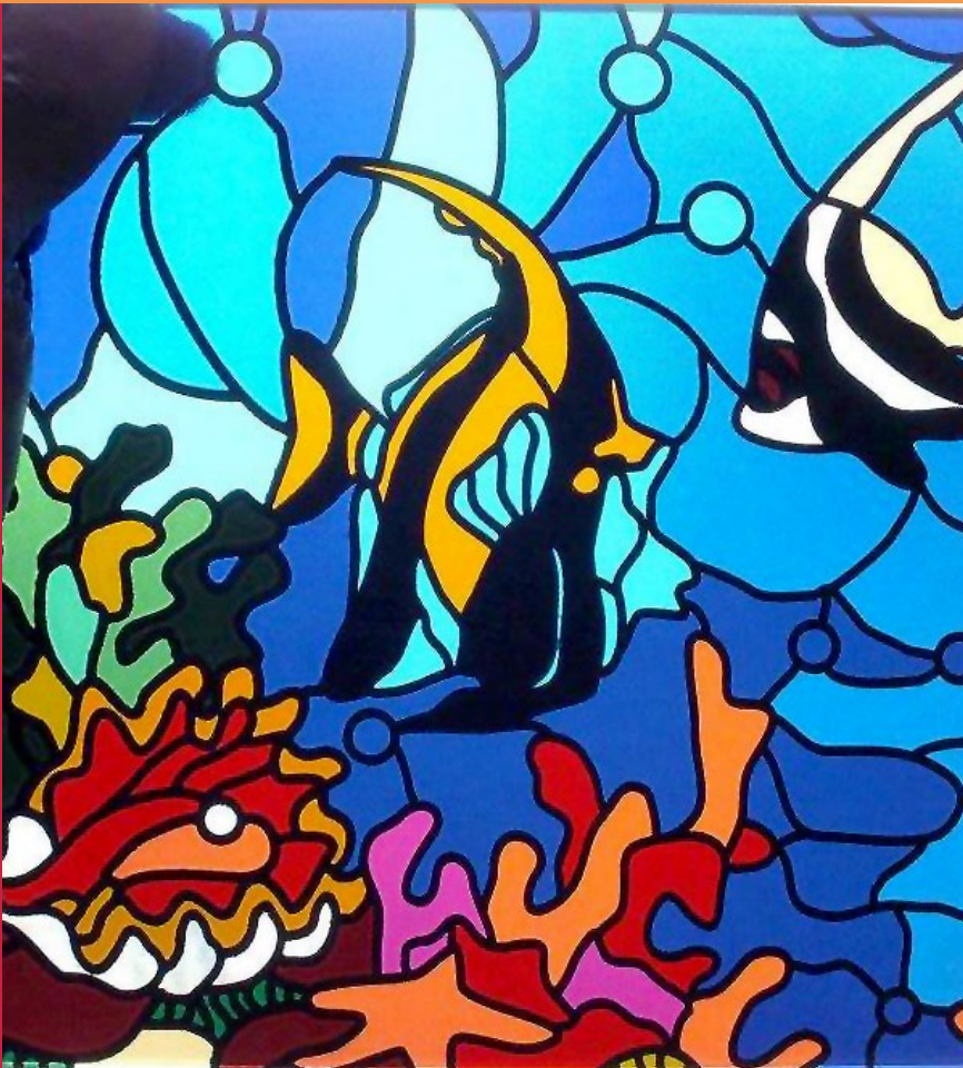
Marine tunes. Stained-glass window imitation in a nautical theme, the volume printing. Printed by SUN Studio Dubai.