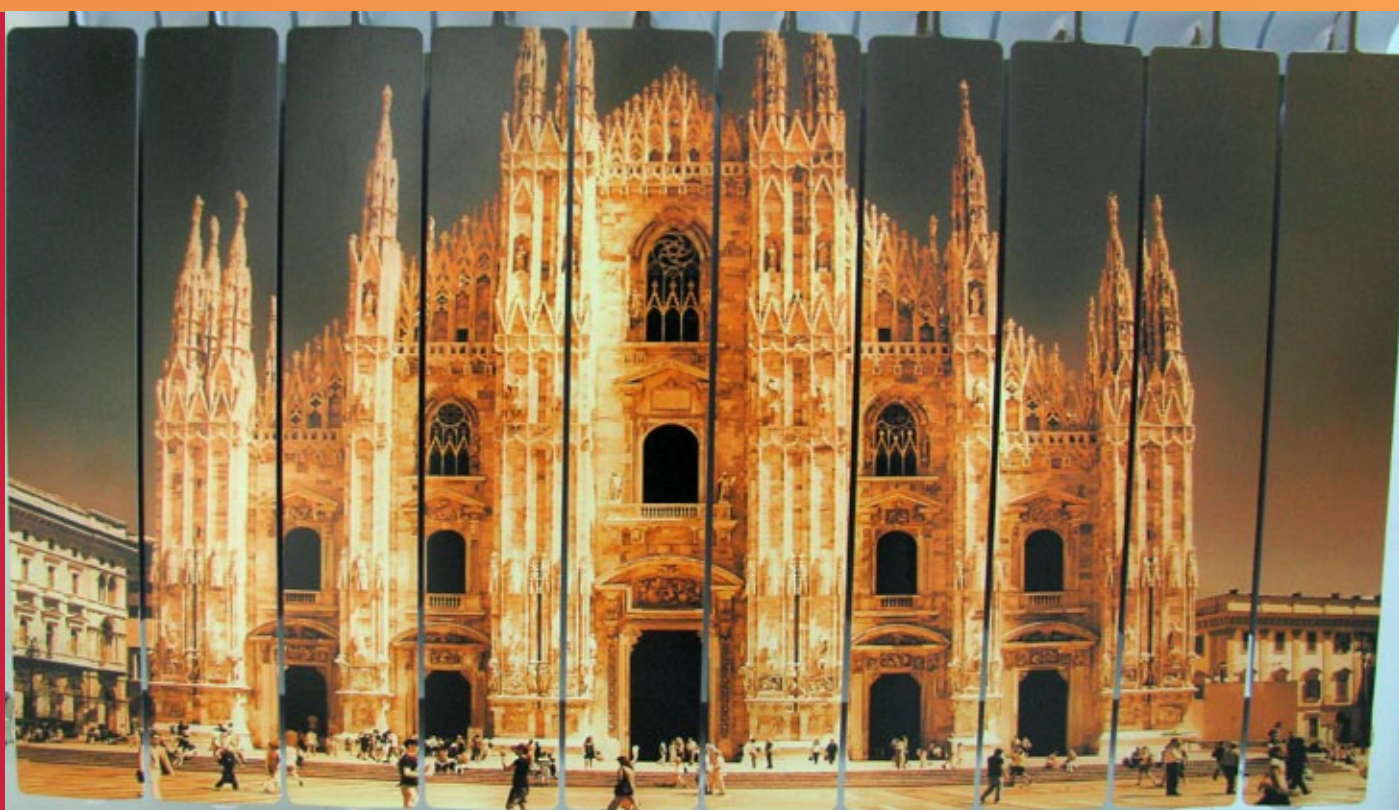
Frozen music. The great monument on the radiator heating system. Work by SUN Studio Astrahan.