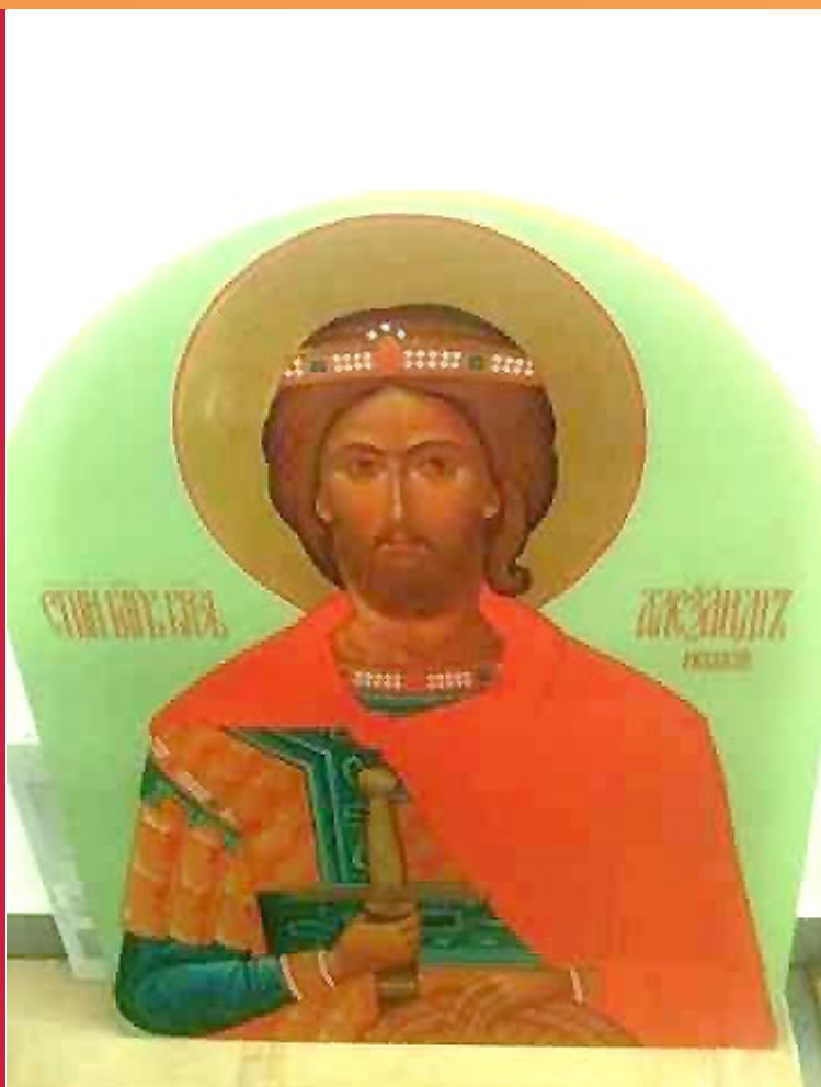
Holy of holies. Icon made on glass from SUN Studio Kemerovo.