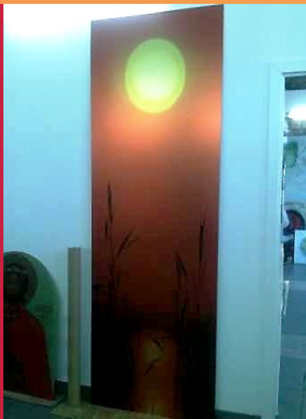
Magic sunset. Printing without the use of white color on glass. Work SUN Studio Kemerovo.