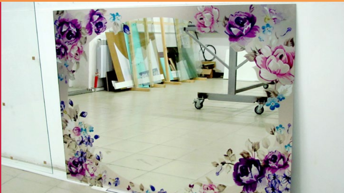
Flower color. Delicate floral ornament on the mirror in the style of Provence from SUN Studio Nalchik.