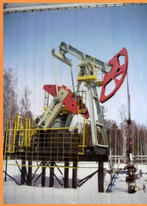
Our all. The process of oil production can be a real work of art. Printed by SUN Studio Tomsk.